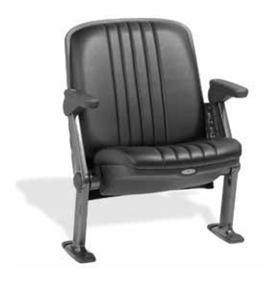
Chairs come in eleven standard widths: 19", 20", 21", 22", 23" & 24" 500 mm, 525 mm, 550 mm, 575 mm & 600 mm