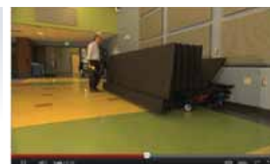
See the Concertina in action! Go to youtube.com/user/hscpublic

5 year factory-backed warranty - the best in the industry.