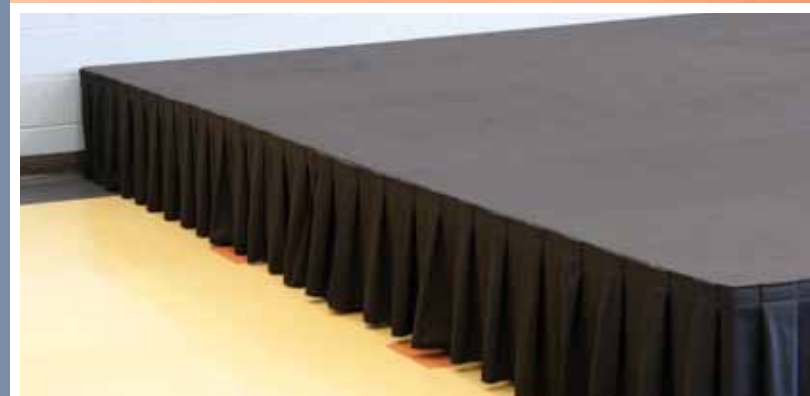
Built with a strong, safe understructure, the Concertina Stage exceeds industry code requirements and offers a firm, quiet performance.

For your added convenience, we provide optional barrier rails, sturdy steps, side skirting, and a customizable cover.